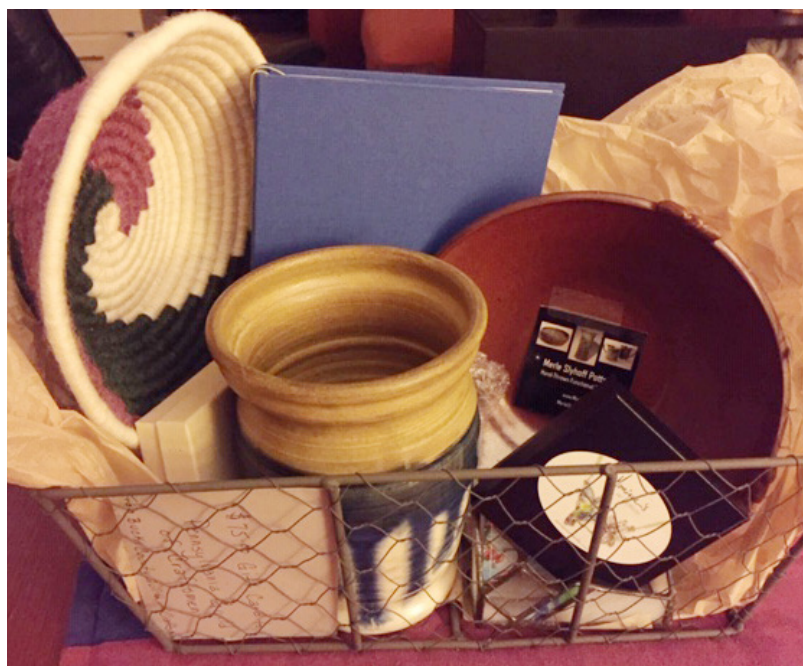
The items that made up the BCGC auction basket.